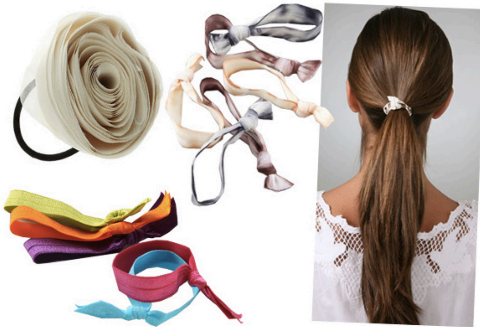
Above, from left: Topshop Fabric Rose Hairband, $18, available at Topshop; Bob Bijoux Hair Tie Set, $45, available at Shopbop; Anthropologie Simple Ponytail Holders, $12, available at Anthropologie.

Ponytail Holders —Sure, they're completely utilitarian, but these hair ties offer a foolproof way to punch things up.